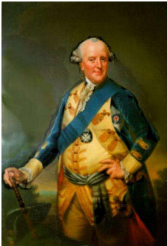
Ferdinand of Brunswick