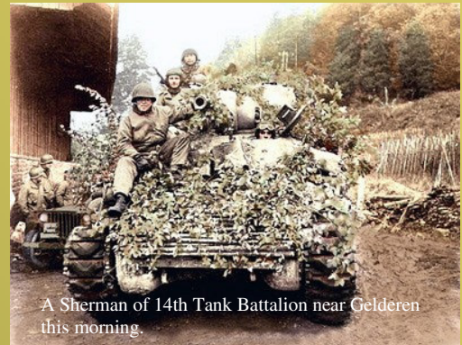
A Sherman of 14th Tank Battalion near Gelderen this morning.