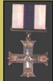
MC awarded to Lt Bligh, 12 platoon, BCoy, 1/5th Queen's Regt Feb 12, 1945.

'B' Coy 1/5th Queen's finally smashed through the stubborn Ab2 / 97Regt of 405 Ersatz this morning. Under intense fire, the position was carried at bayonet point by 25 men of 12 platoon led by Lt Bligh. This attack was pressed home with grim resolve and up to that point the enemy conscripts had offered a spirited defence across a two day period. At close quarters the Germans had no stomach for the fight and after two platoon positions were stormed the surviving elements withdrew. Casualties amongst the 'Queen's' were moderate. Enemy losses were reported heavy. The Nazi commander - Major Apel escaped despite efforts to capture him. He is wanted in more than one sector of the Front for various misdemeanours.